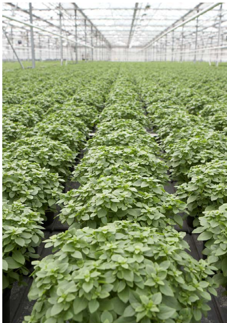
Herb greenhouse, Littlehampton

The work is running through the spring and into early summer, with the final report and recommendations due to be presented to the Board in late July.